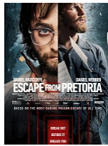
Escape From Pretoria