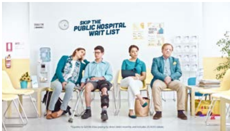
HBF 'Skip the Wait' TVC Cummins and Partners | Production Designer | Studio