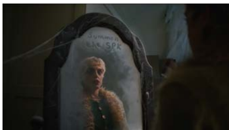
Sour Patch Kids 'Summon the SPK' TVC Hogarth | Art Director | Location