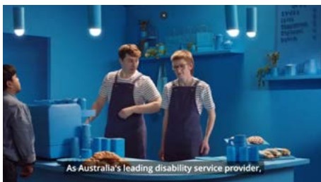
Scope 'Brand Campaign' TVC Truce Films | Art Director | Studio