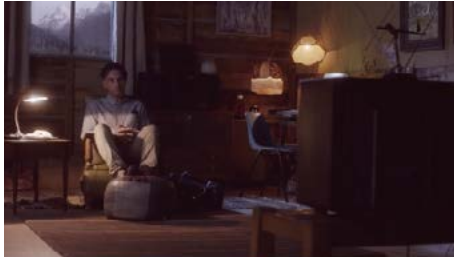
TUKA 'Nirvana' MV Oh Yeah Wow | Art Director | Studio