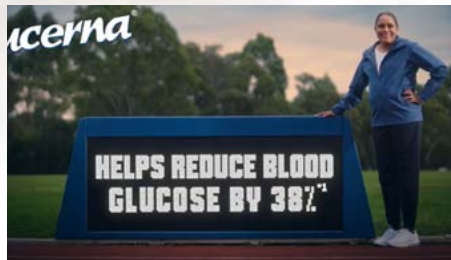
Glucerna 'Brand Campaign' TVC Prodigious | Art Director | Location