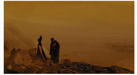
'Splendor Solis' Short Film Independent | Production Designer | Studio