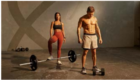
CENTR 'Powershred' Content CENTR | Art Director | Studio