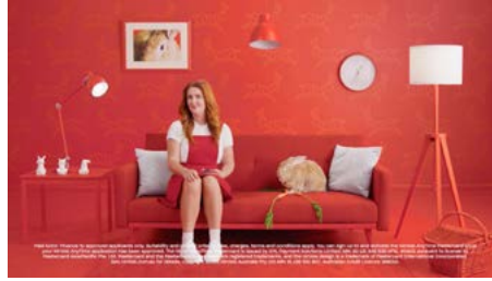
Nimble 'Any Time' TVC Monster and Bear | Art Director | Studio