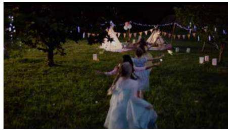
Disney 'A Life More Magical' TVC Creswick Creative | Production Designer | Location