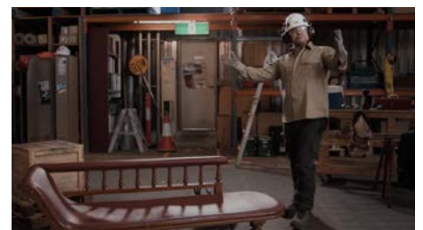
Beyond Blue 'Man Therapy' TVC The Otto Empire | Art Director | Location