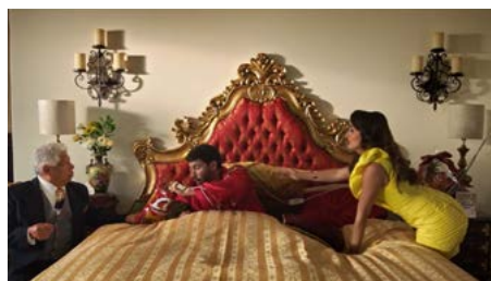
CC's 'Si Si' TVC Guilty | Art Director | Location