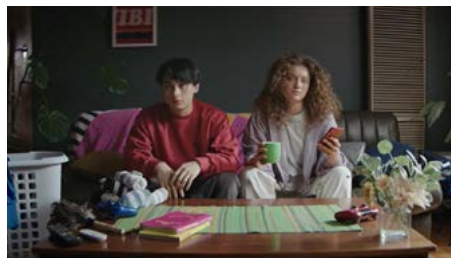
Archie Brothers 'Brand Campaign' TVC Monster & Bear | Art Director | Location