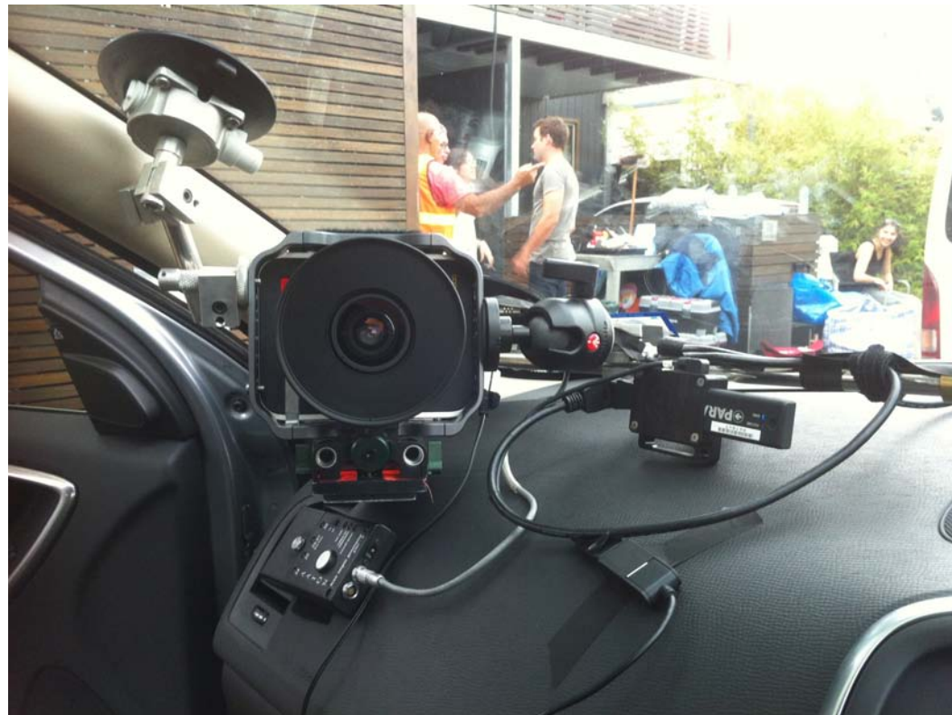
↑ Camcraft's 5/8" rigging kit allows compact solutions in tight spaces.